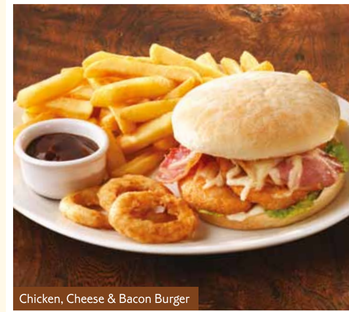
Chicken, Cheese & Bacon Burger