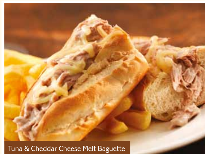
Tuna & Cheddar Cheese Melt Baguette

Baguette filled with cos lettuce, tuna mayo and melted Cheddar cheese.