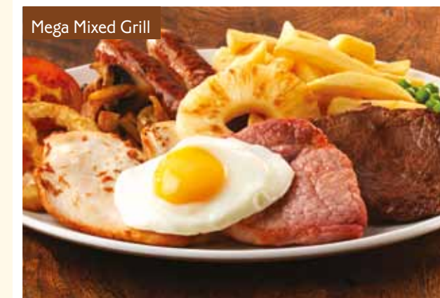
Mega Mixed Grill